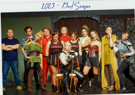
She Kills Monsters