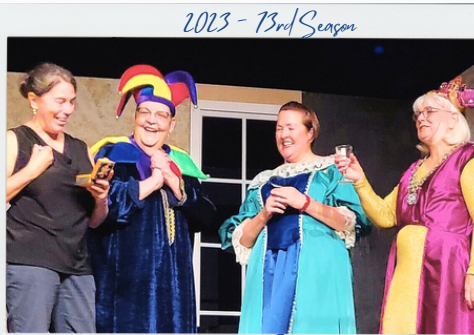
Savannah Sipping Society