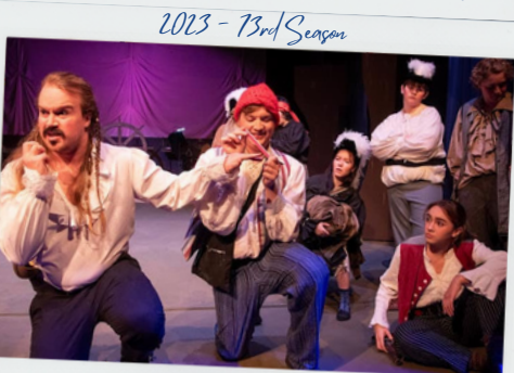
Peter and The Starcatcher