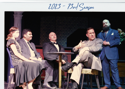
The Great Gatsby