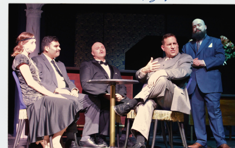
The Great Gatsby

FIRST FULL LENGTH PLAY PRODUCED JANUARY 11-12, 1952