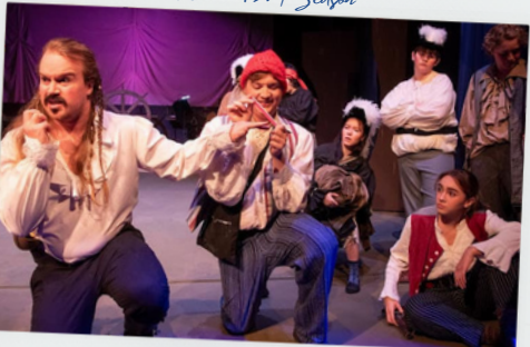
Peter and The Starcatcher