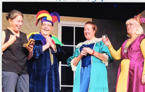
Savannah Sipping Society