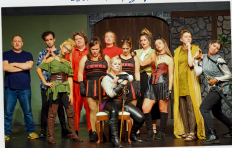
She Kills Monsters